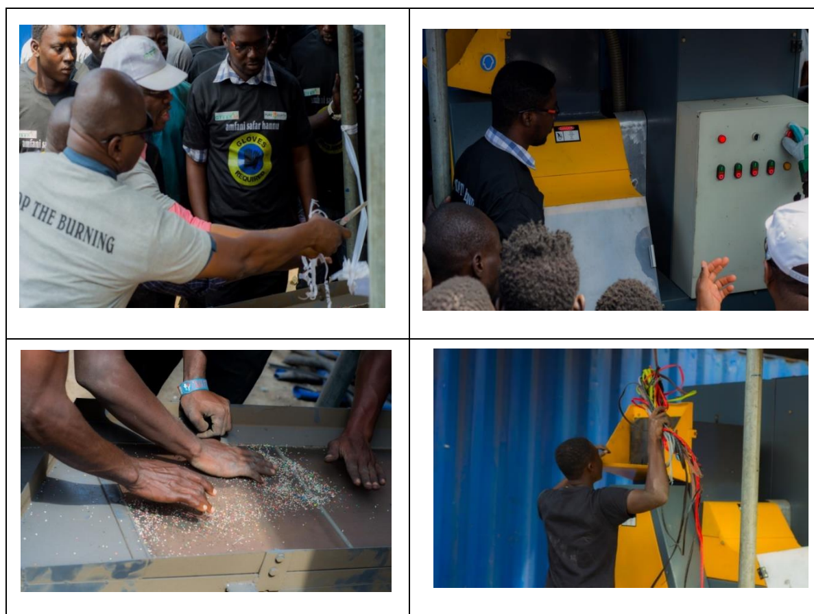
Figure 5.0 Sod cutting and demonstration of new cable recycling machine

After the training session, the new wire stripping machine was then launched and demonstrated its use and efficiency.