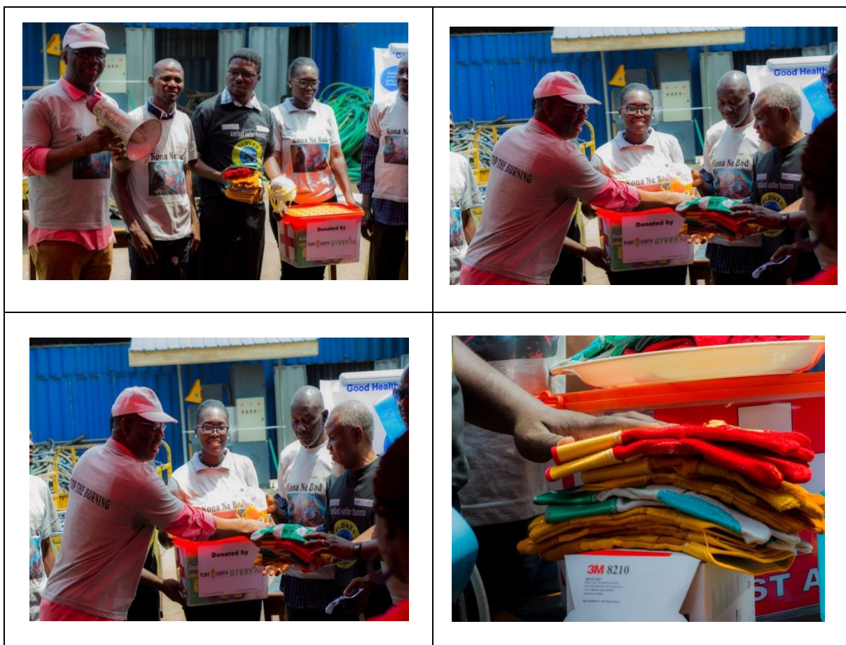
Figure 4.0 Presentation of PPE's and First Aid Box

Personal protective equipment were donated to GASDA for use by e-waste workers. This included nose masks and hand gloves. A fully equipped first aid kit was also presented to be utilized in incidences of cuts, burns, lacerations, bruises and minor accidents sustained from working.