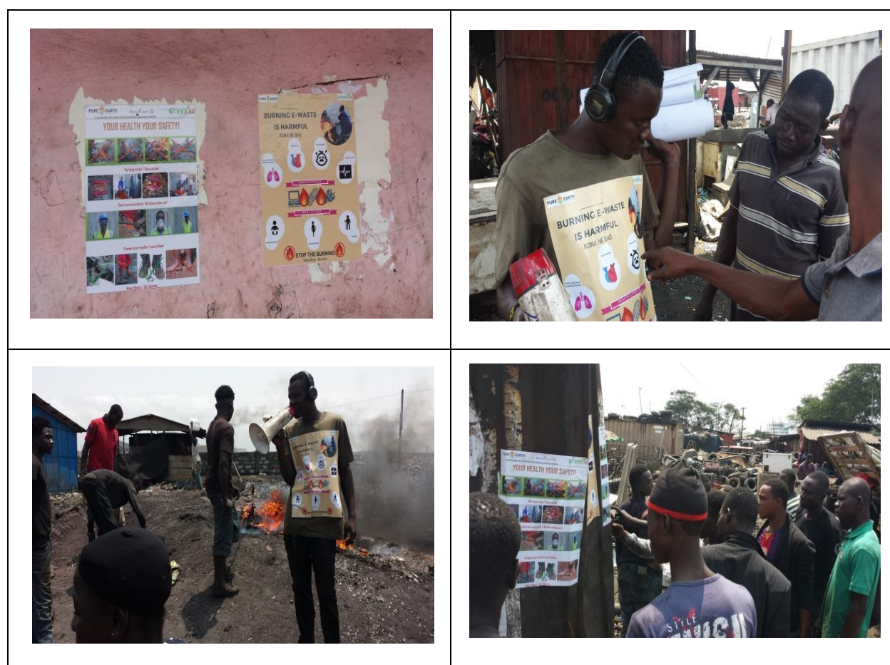
Figure 1.0 Health and Safety Awareness Campaign

On the first day, a team made up of GreenAd and GASDA members embarked on a walk-through of the Agbogbloshie E-waste Site to educate the scrap workers. Focus was on awareness creation on the health effects of burning and exposure to harmful toxins in the smoke. One hundred posters and fliers were distributed and communication was in English, Hausa and Dagbani. This interaction also gave us the opportunity to invite the workers to the health and safety event planned for the next day.