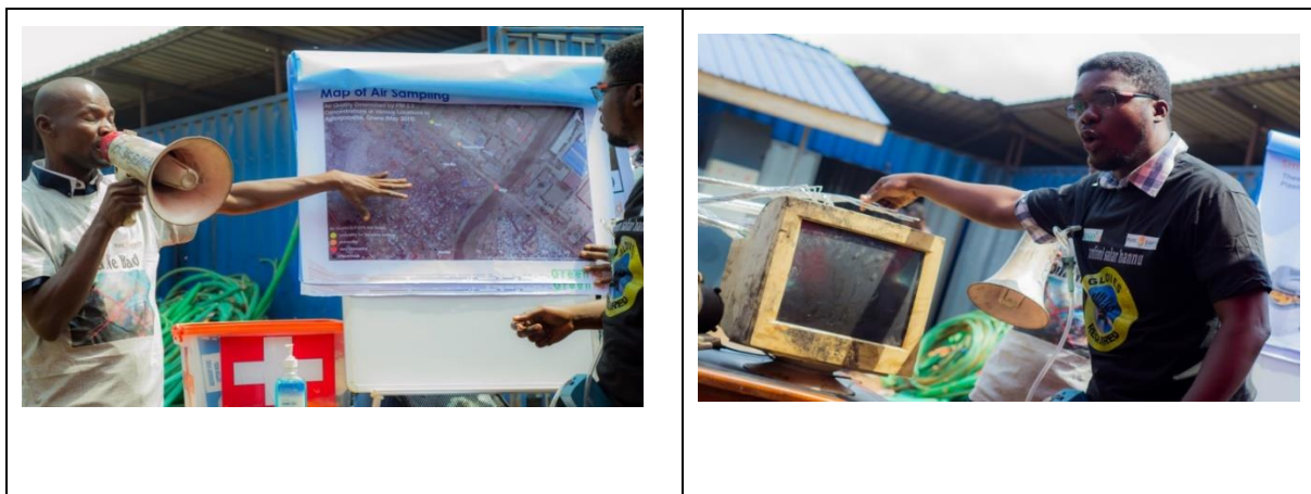
Figure 3.0 Health and Safety Training Session